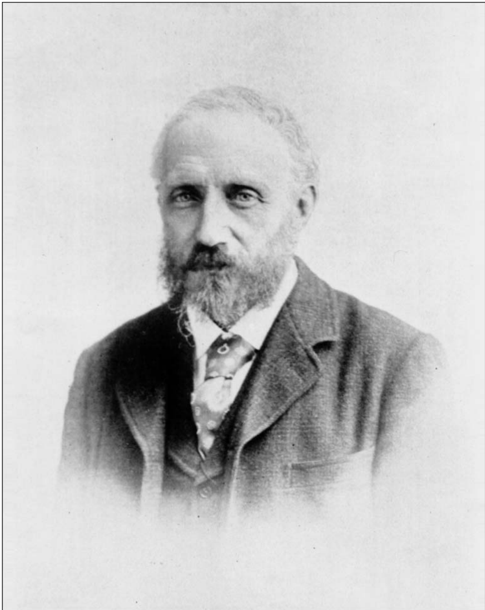
Professor Osborne Reynolds